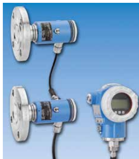
Smart devices such as this differential pressure level transmitter can provide a wealth of information to a modern automation system through a high-speed two-way digital data link such as EtherNet/IP.

Smart devices can seamlessly provide a wealth of data to a modern automation system, and this data can be used by an asset management system as described above. A modern automation system can not only easily connect to smart devices, but also to other typical process plant software applications.